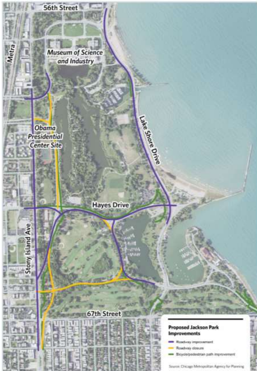
Figure 1. Proposed Jackson Park Improvements

The Chicago Park District recently updated its South Lakefront Framework Plan, part of which includes construction of the future Obama Presidential Center (OPC). 2 The Jackson Park Project would implement the update and support the OPC. In addition, CDOT has outlined two goals for the Jackson Park Project: