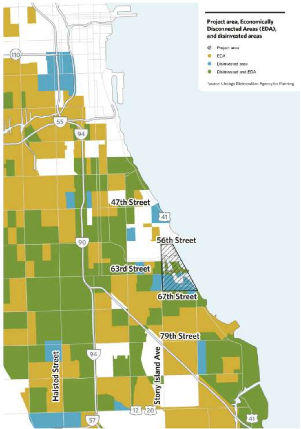
Figure 2. The Jackson Park Project area, economically disconnected areas, and disinvested areas

Jackson Park is located in the Woodlawn Community area, and it is also adjacent to the Hyde Park and South Shore Community areas. This area is particularly relevant to the inclusive