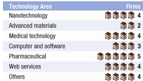
Types of Start-up Companies Listed by Northwestern University, by Industry