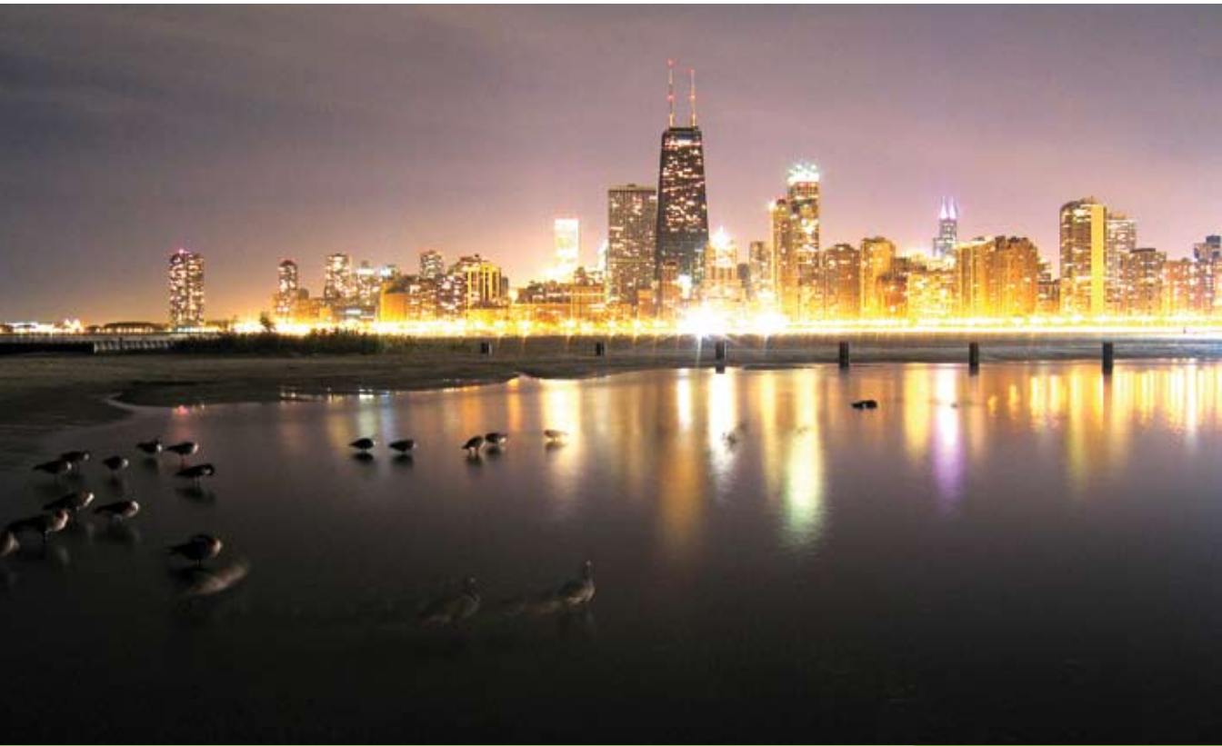
“geese and skyline”