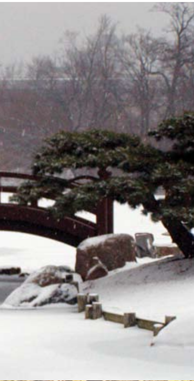
“Japanese Snow” The picture illustrates the quiet beauty of winter.