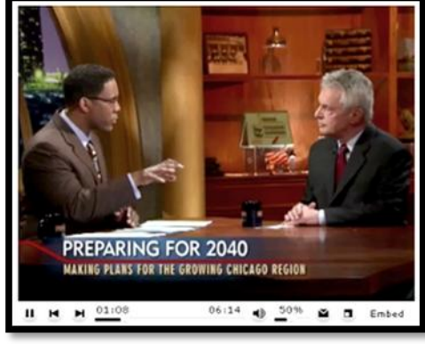
Figure 12 CMAP Board chairman Gerald Bennett on WTTW's Chicago Tonight

Spreading the word about the workshops was also supported through the use of CMAP staff and partners. All CMAP staff were encouraged to take GO TO 2040 posters and postcards to their favorite local coffee shops or other locations. External Relations staff contacted community leaders in and around the workshop area to inform them and encourage attendance at the workshops. Staff also spent time at Metra locations handing out flyer for workshops and post workshop posters at train stations,