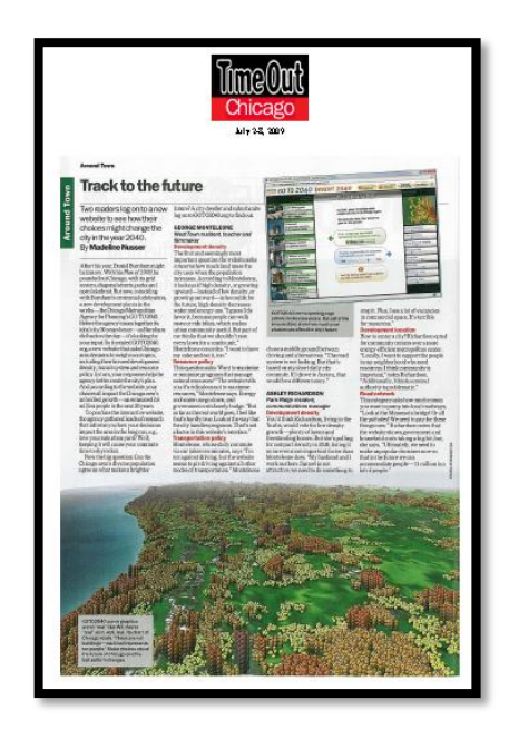
Figure 13 TimeOut Chicago article